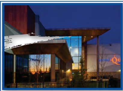
Northern Quest Resort & Casino

Approx. 7-8 pesticide credits will be provided over two days. (Plus essential non-accredited Safety Seminar on Wednesday and supplier/maintenance info throughout the conference.)